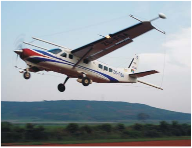
Figure 3: The Genesis electromagnetic system mounted on a Cessna 208B, Kakira, Uganda.

A unique component of the airborne geophysical survey programme is that it incorporates the first large-scale survey by the Genesis time-domain electromagnetic system (Figure 3), which has completed one survey block, and will fly a second, for a total of 7,900 line-km. The remaining six blocks will be flown using the Geotem system on a helicopter platform.