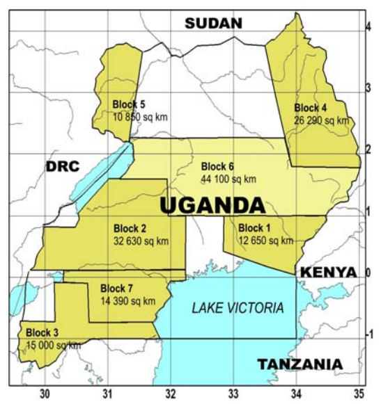
Figure 2: Index map of the survey blocks for the new airborne magnetic and gamma-ray spectrometric surveys in Uganda.

Paterson, Grant & Watson Limited, together with Earthworks/GeoWitch, was awarded the contract to provide supervision and quality control of the airborne surveys. This contract incorporates a program of institutional strengthening, including formal and on-the-job training. An innovative component is the Management of Change programme provided by the Maastricht School of Management. This focuses on developing awareness of how institutions such as the DGSM must adapt to change as they move into the digital age, and are required to meet the demands of their clients in the 21<sup>st</sup> century.